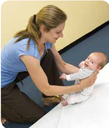
Pick up baby or toddler using good lifting technique.

Never carry a full baby bath. Use jug or bucket to fill and empty.