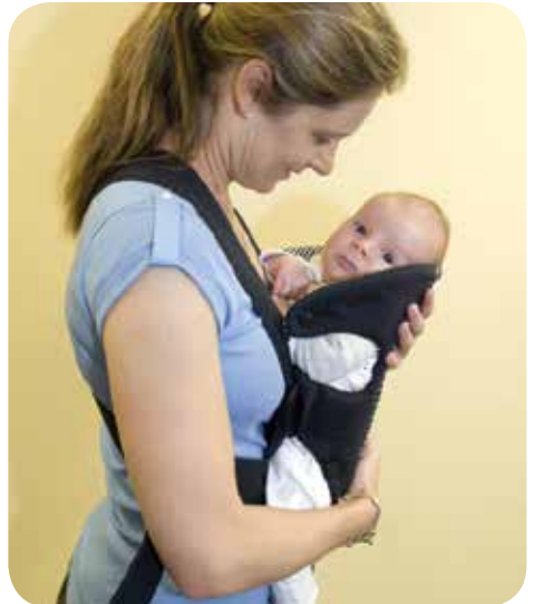
Try a sling.