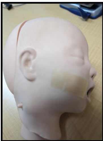
Figure 1 Hydrocolloid Tape Placement