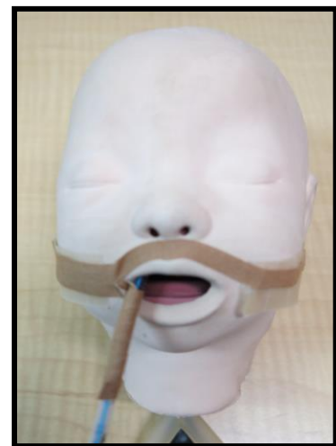
Figure 3 Trouser leg tape