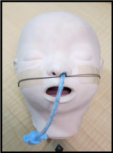
Figure 2 Double knot with silk