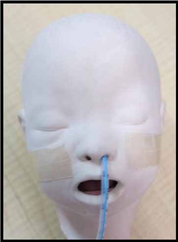
Figure 1 Hydrocolloid Tape Placement