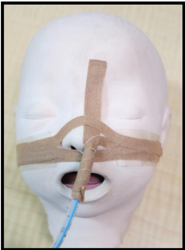
Figure 5 Second Trouser leg tape