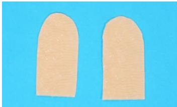
C) Hydrocolloid tape x2