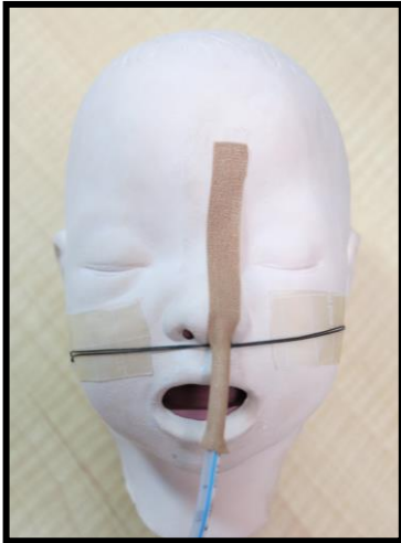
Figure 3 Anchor Tape