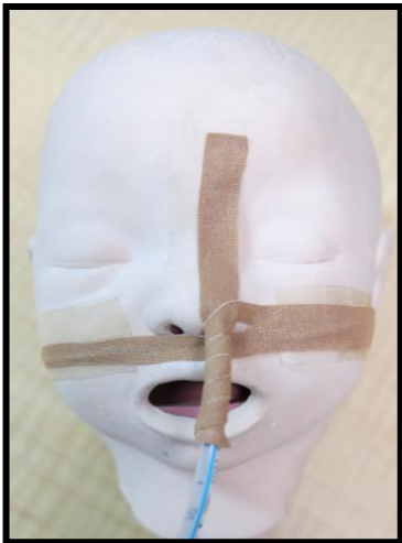
Figure 4 First Trouser leg tape