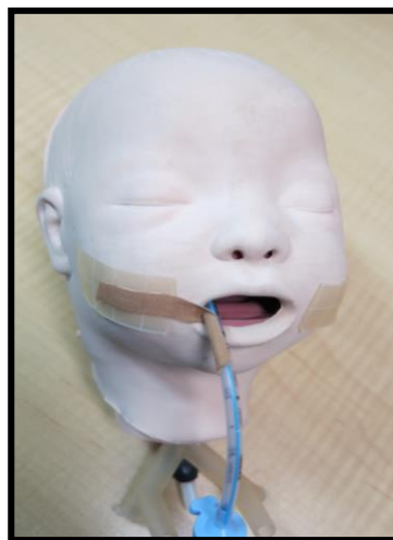
Figure 2 Anchor tape