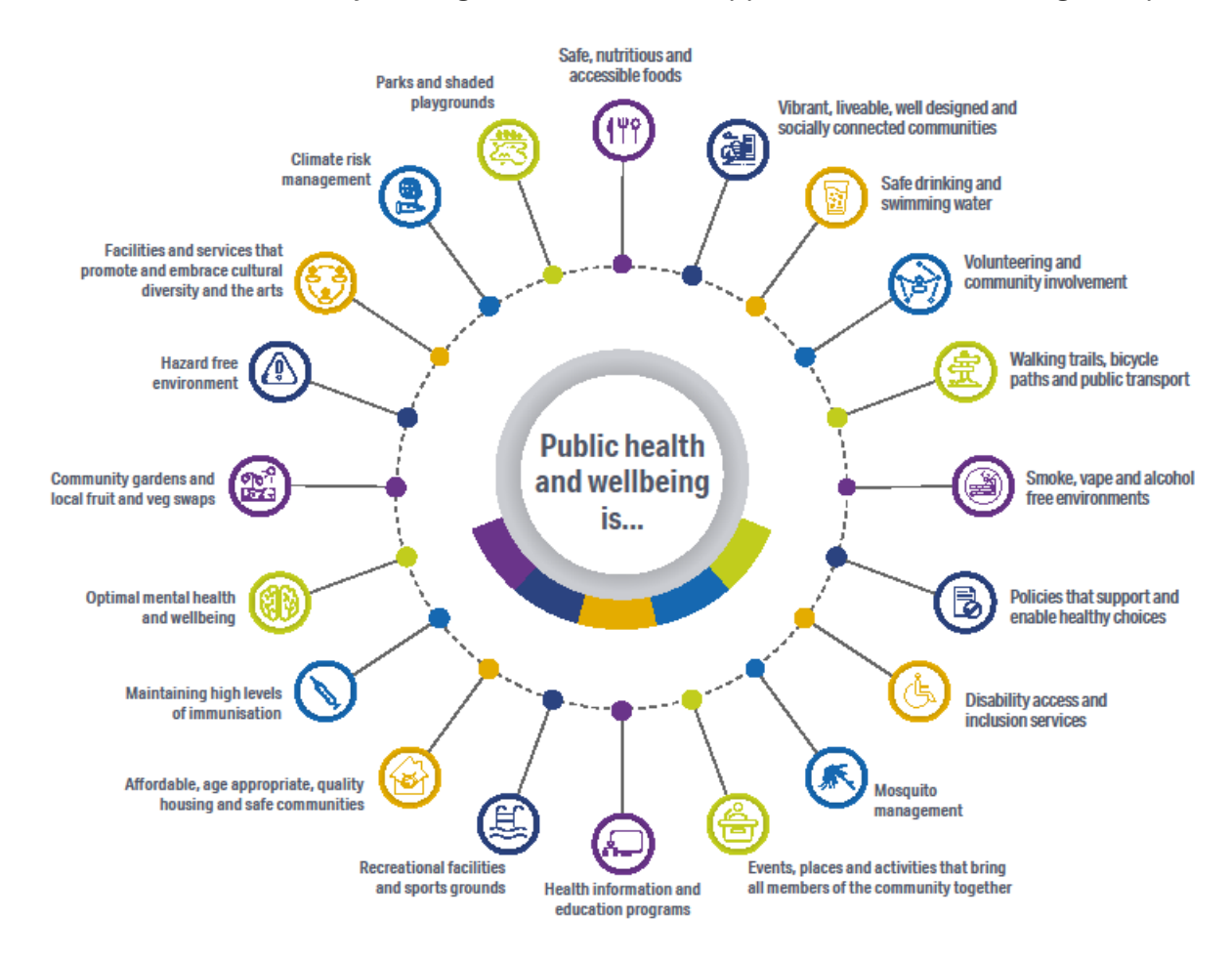
Figure 1: Public health and wellbeing

Public health refers to the health and wellbeing of the public; it is much more than just the provision of health services and managing environmental health risks but encompasses all aspects of life that enable the community to thrive (Figure 1). By actively planning for the best public health outcomes of a community, local governments can support and drive the changes required.