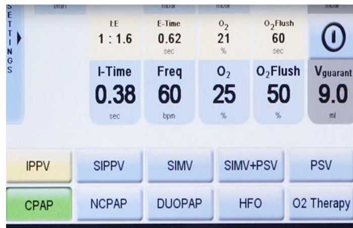
Modes of ventilation screen (Fabian)

If using a sidestream CO 2 sensor, flow calibration needs to include the CO 2 sensor to ensure accurate recording of the VT delivered to the infant.