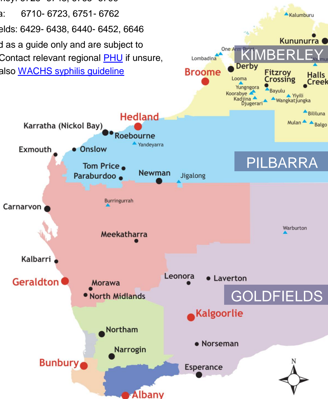
Illustration Copyright 2020 King Edward Memorial Hospital

*Provided as a guide only and are subject to change. Contact relevant regional PHU if unsure, and see also WACHS syphilis guideline