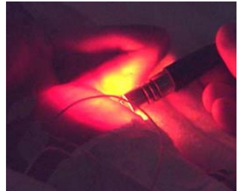
Image: Transillumination of the chest